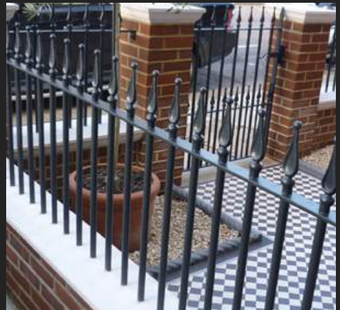
Steel Railings with Ornate 'Arrow' Tips