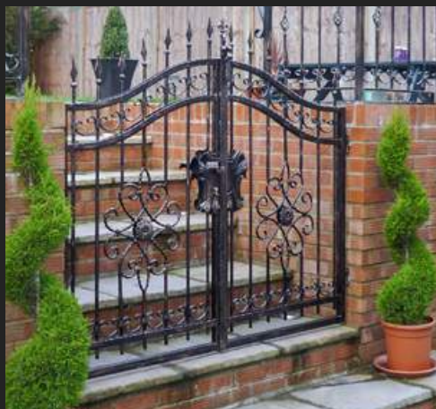
Bespoke Steel Gate with Hand-Forged Ornaments