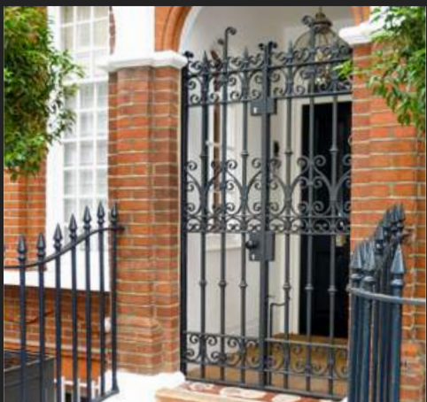
Ornate Steel Gate