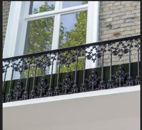
Bespoke Steel Ornate Balcony