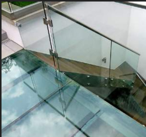
Stainless Steel & Glass Balustrade