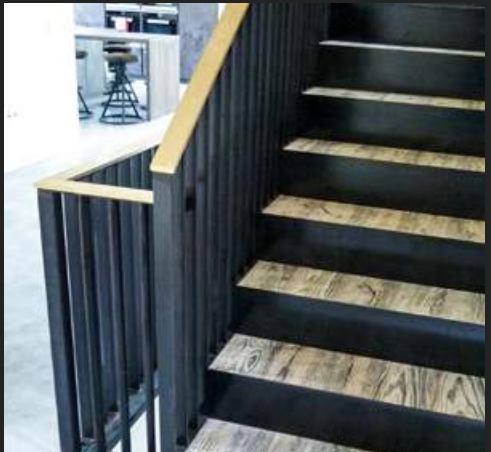
Mild Steel Staircase with Brass Handrail