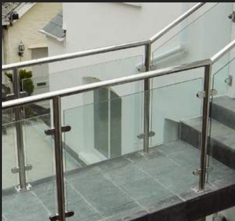
Stainless Steel & Glass Balustrade