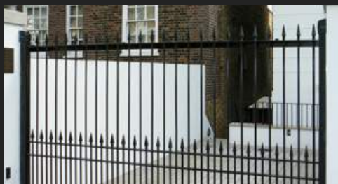
Gates & Railings