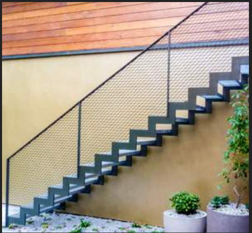
Zig-Zag Steel Staircase with Mesh Balustrade