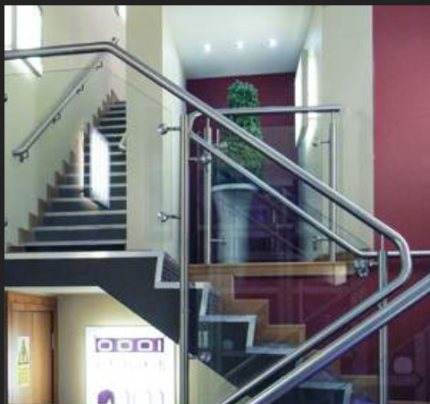
Stainless Steel & Glass Balustrade