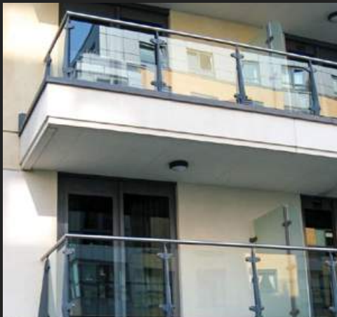
Steel & Glass Balcony with Stainless Steel Handrail