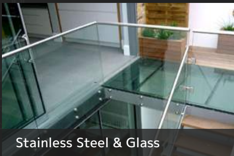
Stainless Steel & Glass