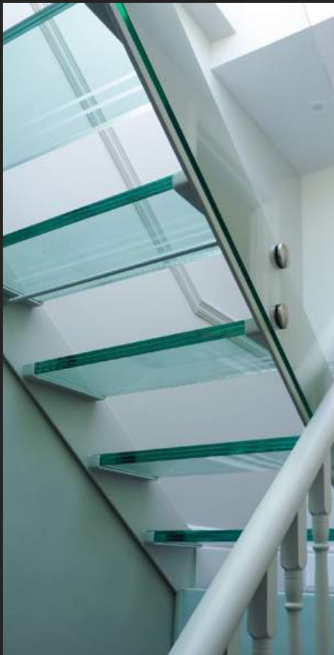
Bespoke Stainless Steel & Glass Staircase