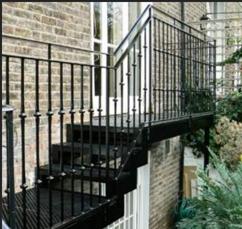
Steel Balcony with Stairs & Hand Forged Railings