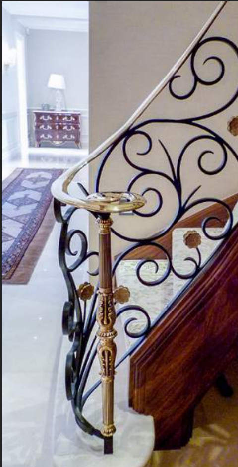
Ornate Steel Balustrade & Polished Brass Handrail