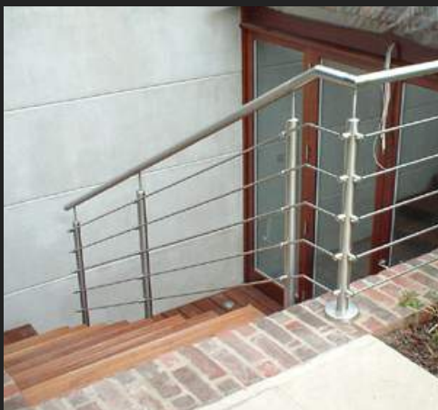
Stainless Steel & Steel Wire Balustrade