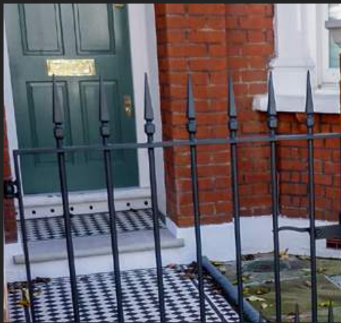
Steel Railings with 'Spike' Tips