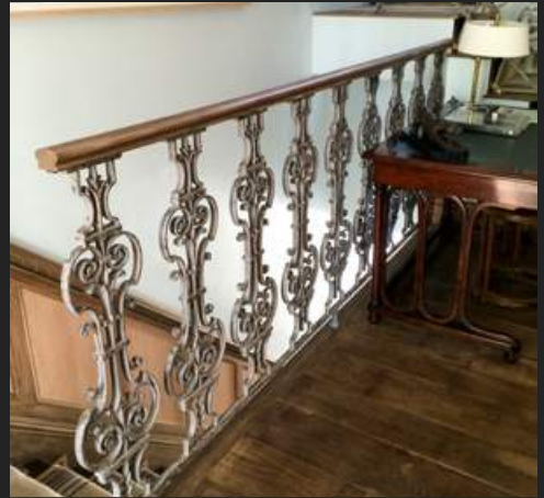
Antique Ornate Cast Iron Balustrade