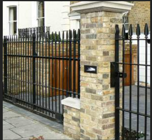
Bespoke Steel Railings with Matching Gate