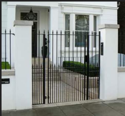
Steel Gate with Matching Railings