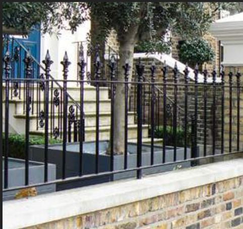
Steel Railings with Ornate Tips