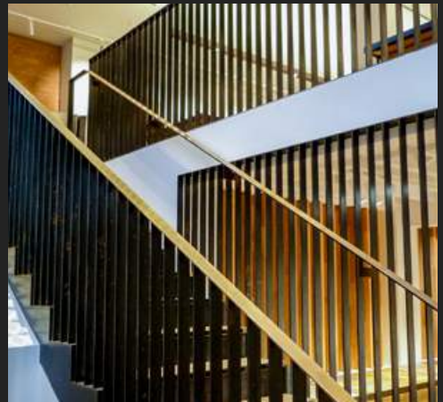
Bespoke Steel Balustrade with Brass Handrail